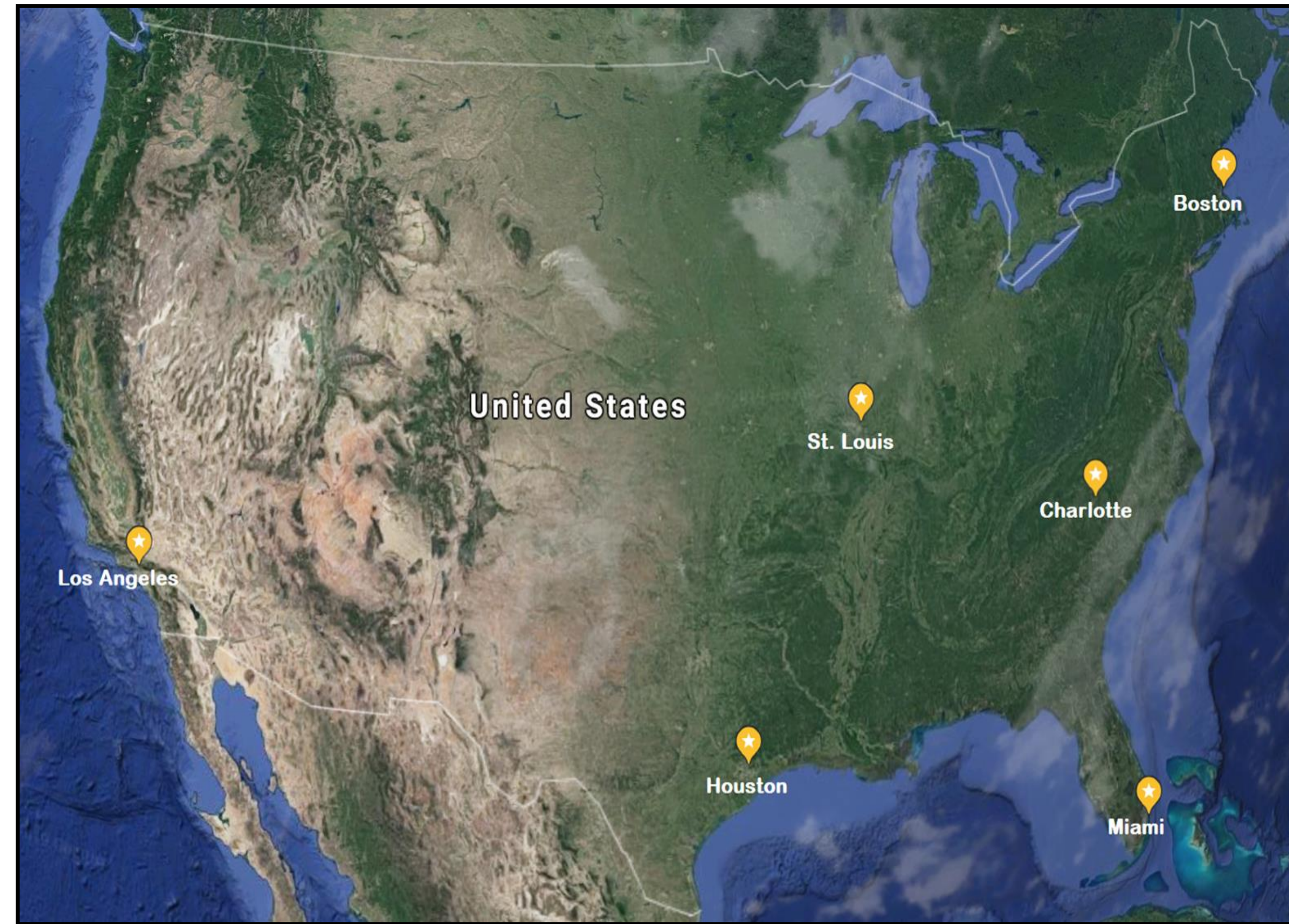
The six metropolitan areas we will proceed with.

The initial data we needed was tax assessment data, land deed records, and business filing data. We called and emailed hundreds of counties in ~40 metropolitan areas to locate and receive these types of data as far back in time as possible. This data is collected differently by county, so after data gathering, we must process and standardize the data.